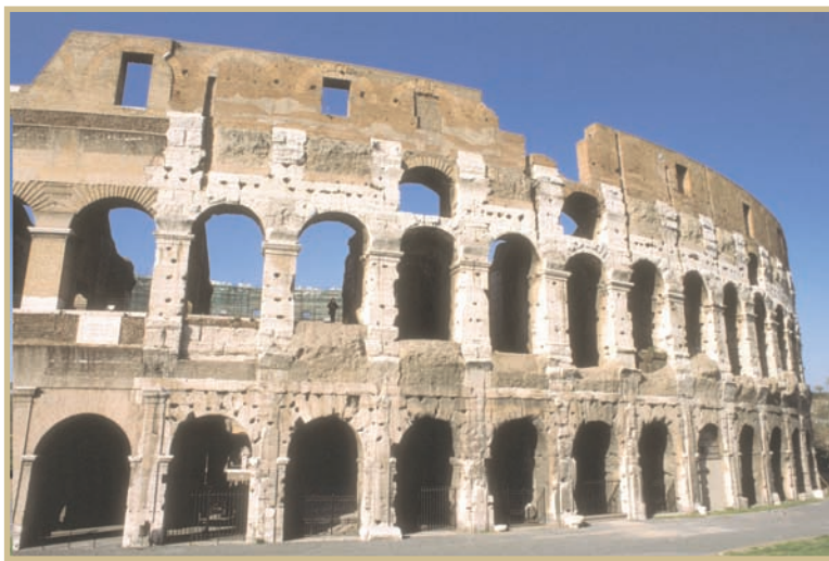
FIGURE 3 —The roots of modern law can be traced back to Roman days.

The modern legal practices that are known to much of the Western world mainly evolved from the practices and precedents established in ancient Rome (Figure 3). Latin was the common language of the Roman legislators, and many of the concepts handed down from ancient Roman lawmakers are still expressed most concisely in the Latin original. As a member of the legal profession, you'll need to master a broad range of Latin words and phrases commonly used in the practice of law. These terms form a major part of our everyday legal language.